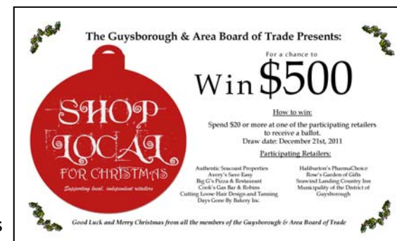
2011 Shop Local for Christmas Campaign