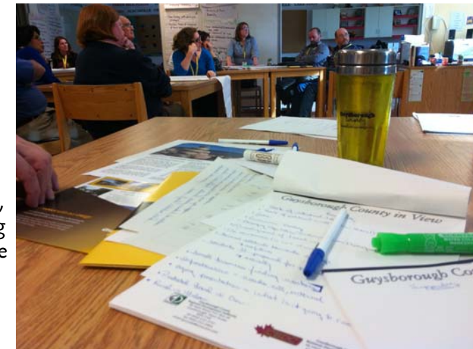
Leadership Forum October 29, 2011

The GCRDA Board of Directors will approve the final plan which is expected to be complete by March 31, 2012.